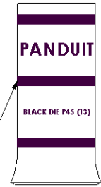
Color coded barrel markings